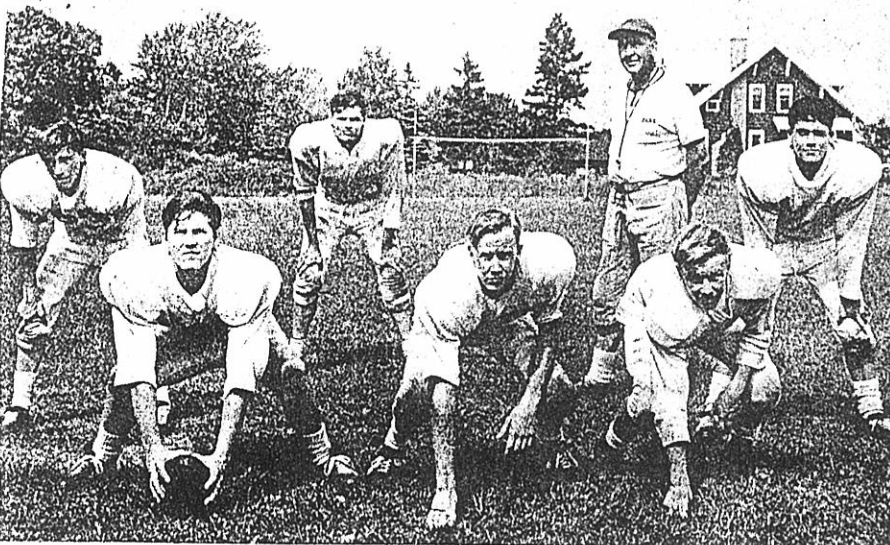
STARTING LINEUP FOR OPENER