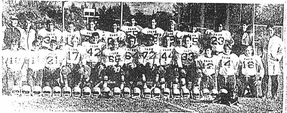
PARK SCHOOL FOOTBALL TEAM